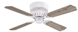
Reversible White Washed Pine Finish Blades