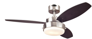
Reversible Wengue Finish Blades