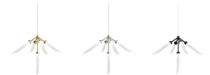
frost/aged brass frost/satin nickel frost/matte black